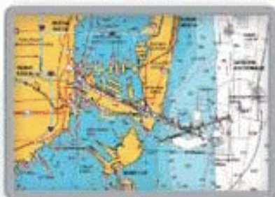
Shaded Depth Contours with user-selectable depth safety, spot soundings, navalds w/XPain™