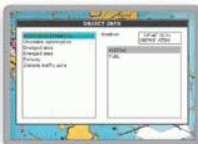
Enhanced Port Services port services w/phone #'s, port plans, major coastal roads, increased wrecks